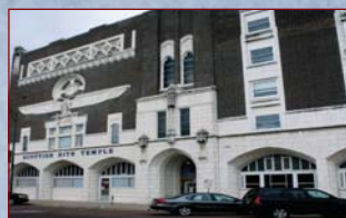
Scottish Rite Masonic Temple

This Masonic Temple, constructed in 1923, features century-old stage backdrops valued at over $200 million and a costume collection worth over $2 million. The auditorium is equipped with a two-story pipe organ. Tours are available – walk-in or by appointment. Pipe organ concerts are available if scheduled in advance.