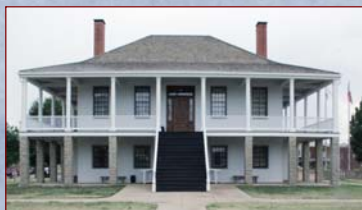
Fort Scott National Historic Site

Immerse yourself in the conflict and turmoil of the Bleeding Kansas years, and imagine the sights and sounds of soldiers preparing for the Civil War.