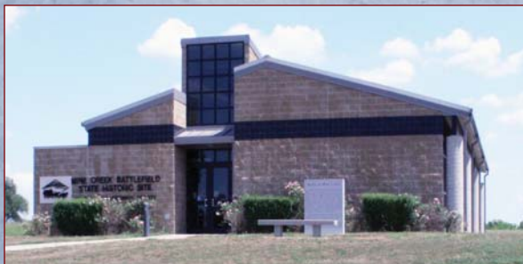
Visitor Center, Mine Creek Battlefield SHS

In October 1864, outnumbered Federal forces attacked a retreating Confederate Army along the banks of Mine Creek and won. The Confederate's objective during the retreat on the way back to Missouri was to seize the ammunition and supplies stored at Fort Scott. The largest cavalry engagement of the Civil War, Mine Creek was the only major Civil War battle fought in Kansas. This dramatic story comes alive in the visitor center where you will see Civil War era uniforms, weapons, and photographs.