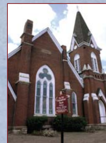
Old Congregational Church

The 1873 Congregational Church was built in 1873 and is the only remaining single-steeple church in Fort Scott. Saved from demolition in 1968, the structure is now owned by the Historic Preservation Association and is listed on the National Register of Historic Places. The church is currently used as a wedding and special event venue.