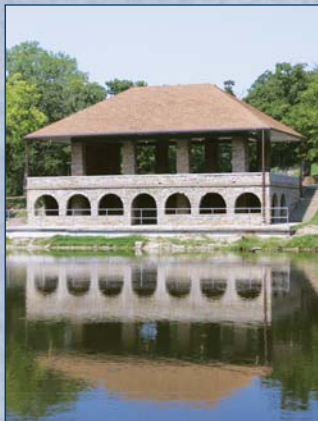
Rock Pavilion at Gunn Park