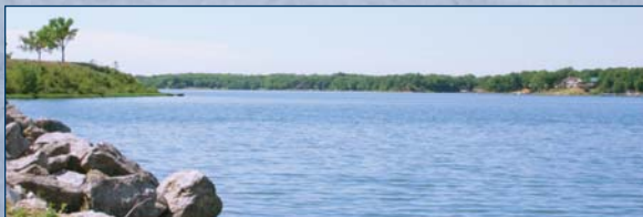
Lake Fort Scott

Nestled in a lush, heavily wooded, rural setting teeming with wildlife, the 352-acre Fort Scott Lake provides residential living, as well as public boat-loading ramps for fishermen and water-skiers with restricted areas for all three. Stocked annually with channel cat, walleye, small-mouth bass, crappie, muskie, and bluegill, the lake provides many hours of recreation for anglers. Lakeside campsite areas, shelter houses, and picnic areas are available to residents and visitors, alike.