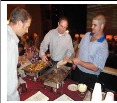
2010 Forks & Corks