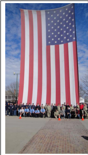
Patriot Flag Ceremony January 29, 2011