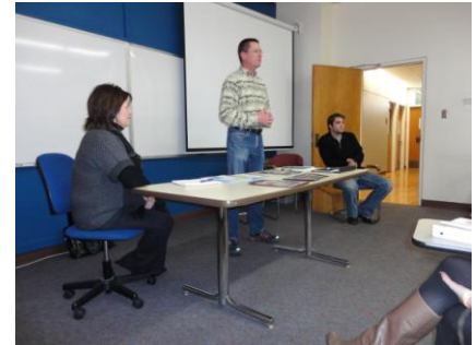
KU Marketing Study Presentation * Tourism & Economic Development

The Chamber has been working with several business owners that are interested in placing a business downtown from retail, offices to restaurants. One of those businesses, a local favorite, Papa Don's opened in May. Hopefully at least one other business will come to fruition soon!